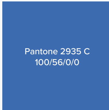
Refinitiv Blue for print