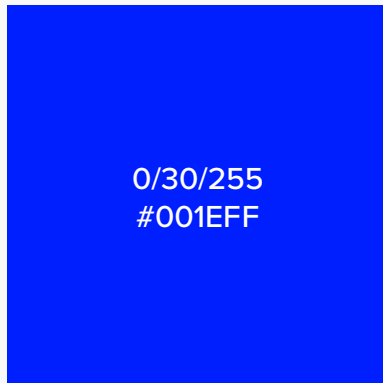
Refinitiv Blue for digital